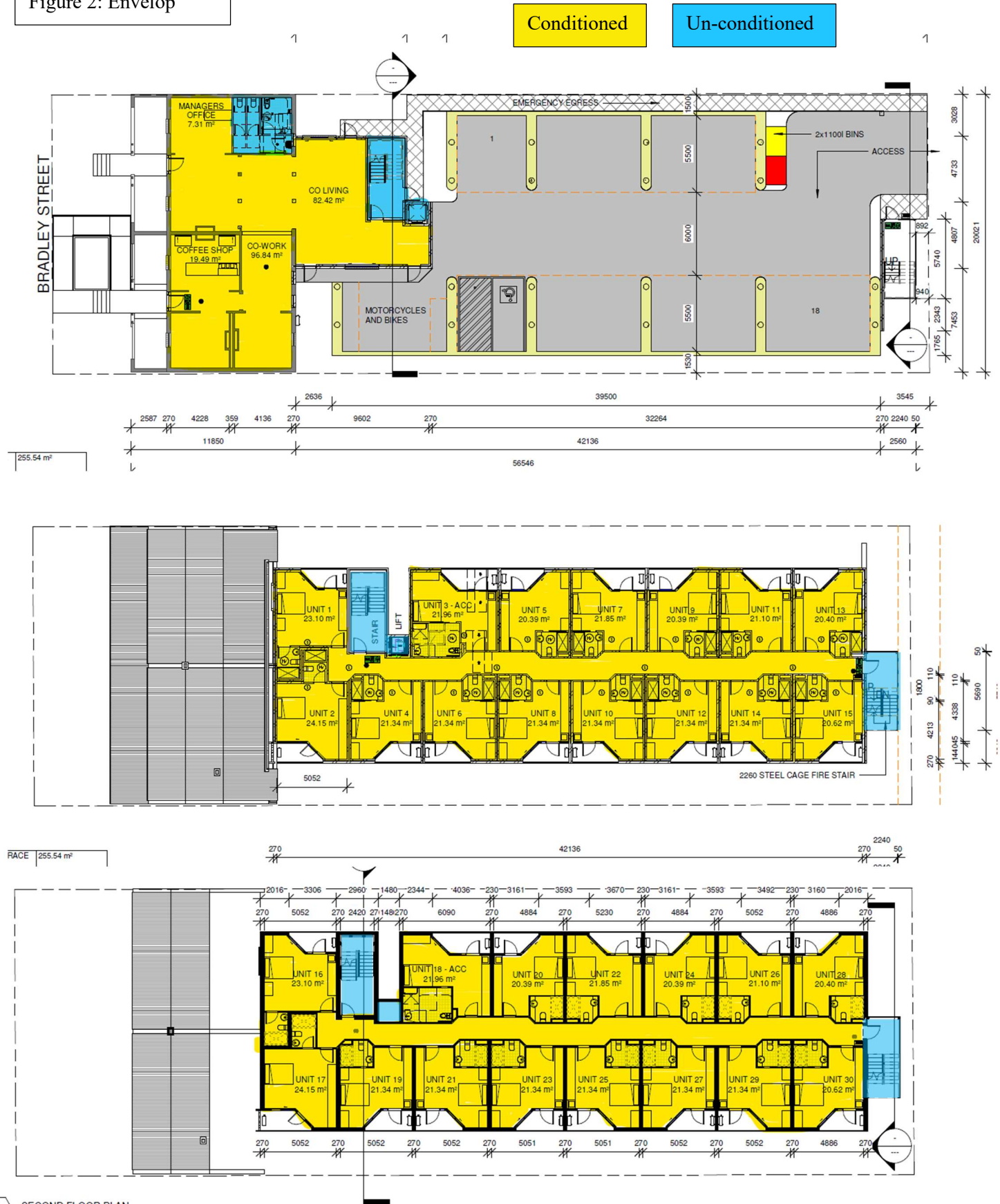
Figure 2: Envelop